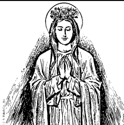
Oh Mary, we crown thee with blossoms today

All students are invited to join in the procession for our May Crowning and to place a rose at Mary's feet. Any students interested in being a part of the procession should meet in the Gathering Space before the 11:00 Mass on May 13.